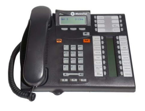
Infinity 5000 Series devices: 5010, 5006, 5046 Module. 7316 Digital Device